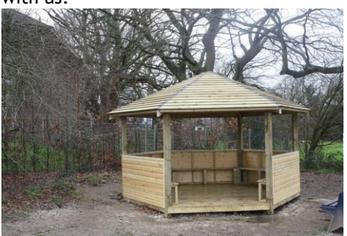
COMPLETED OUTDOOR CLASSROOM

We have set aside £1,300 from the Autumn Term fundraising towards the next phase - the development of the pathways. If you know any local businesses that may wish to contribute to the project please put them in touch with us.