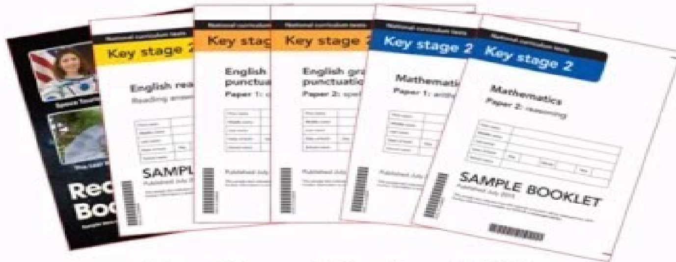
Key Stage 2 tests - 2016