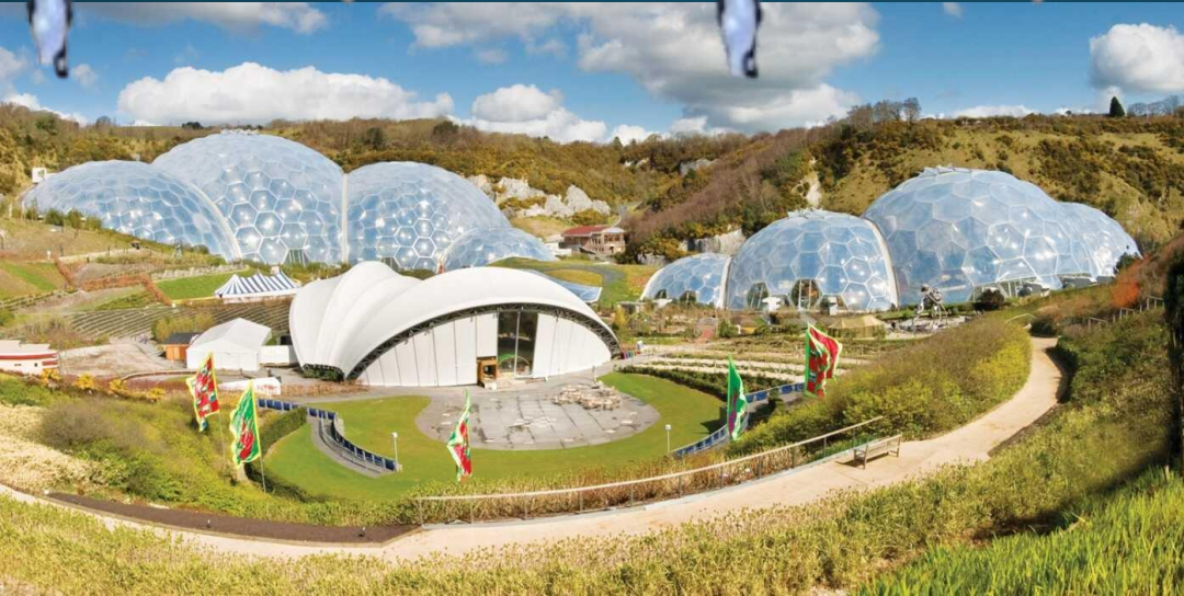
The Eden Project.