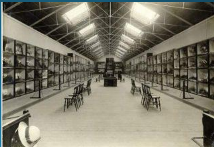
The Booth Museum, Brighton