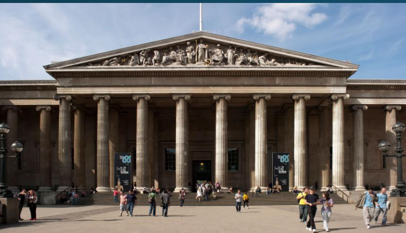
The British Museum, London