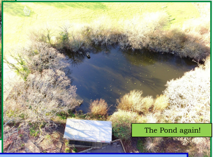
The Pond again!