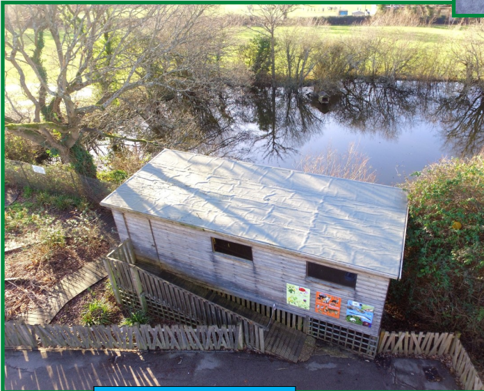
The Bird Hide & Pond