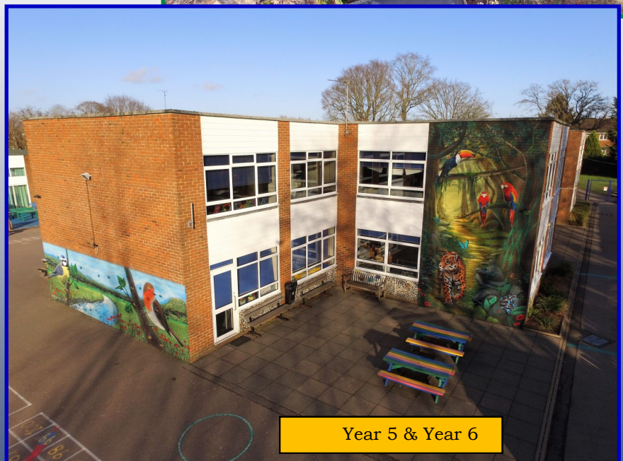
Year 5 & Year 6