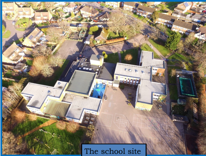
The school site