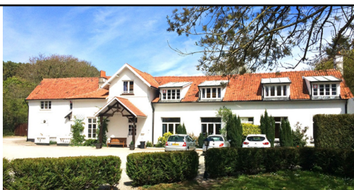
September 23rd - 27th 2019